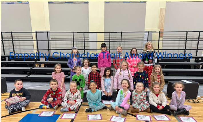
Empathy Character Trait Award Winners